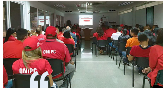
This photo was taken before the COVID19 pandemic.

ASYCUDA came to change the way of doing things, not only in the public sector but also in the private sector. Currently, the several logistic auxiliar users are quite different after ASYCUDA arrival: better prepared, more aware of the technological advances, and always ready to do our job in the best possible way.